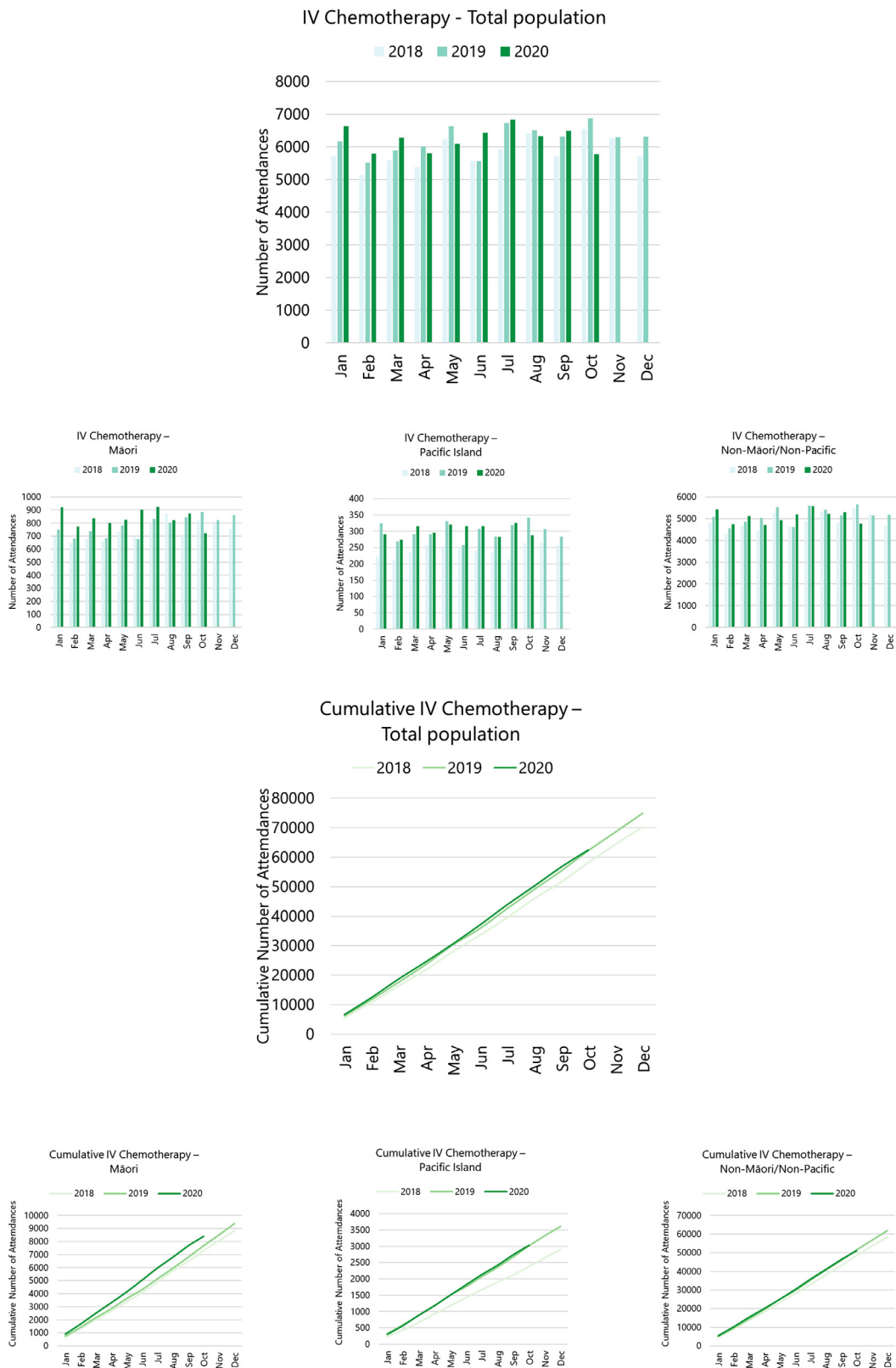
Fig. 4. The number of intravenous (IV) chemotherapy attendances over 2020 compared to 2018–2019, by month (top) as well as cumulative total (bottom), for the total population and stratified by ethnicity.