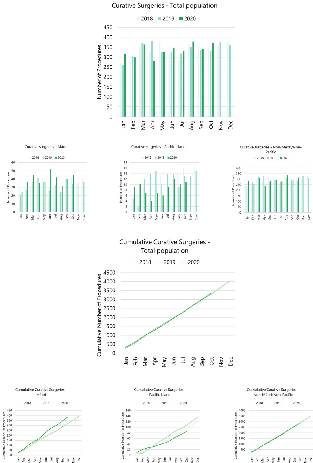
Fig. 3. Combined number of prostate, colorectal and lung surgeries performed over 2020 compared to 2018–2019, by month (top) as well as cumulative total (bottom), for the total population and stratified by ethnicity.