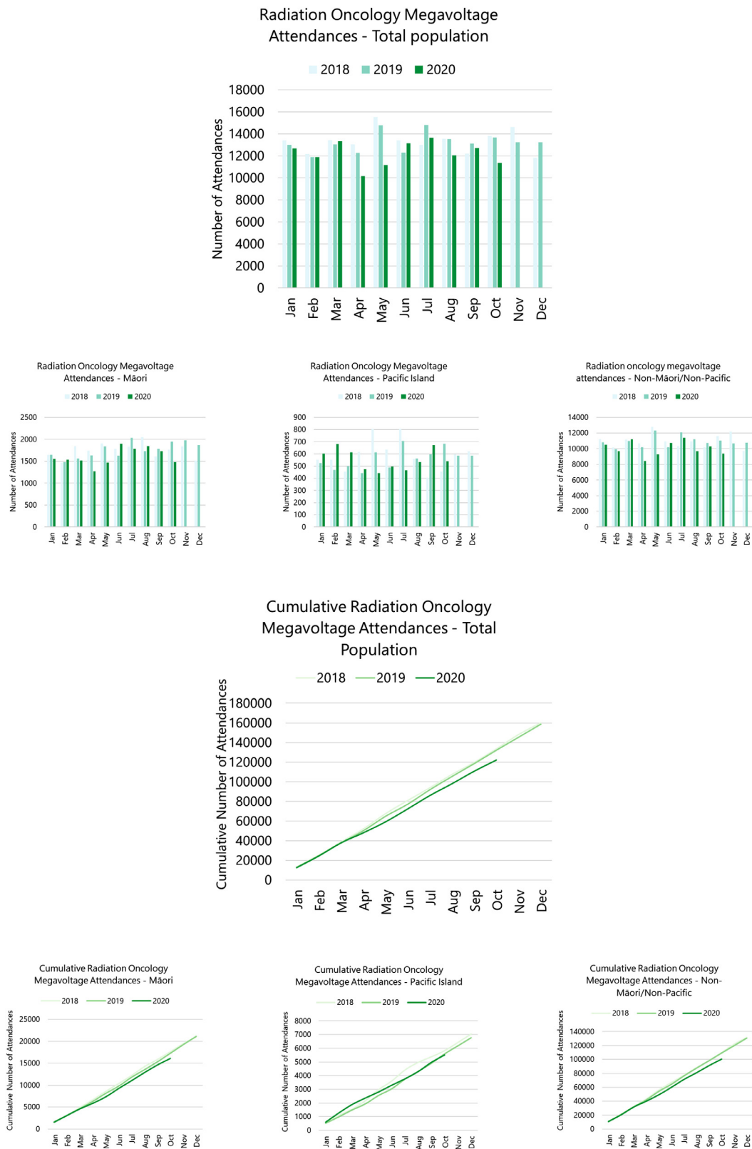
Fig. 5. The number of radiation therapy attendances over 2020 compared to 2018–2019, by month (top) as well as cumulative total (bottom), for the total population and stratified by ethnicity.