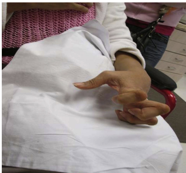
Fig 2 Case 2 preoperative hand position.

catheterization, and ease positioning in her wheelchair. Twelve days after her surgery, we injected onabotulinumtoxinA using E-Stim and a 2:1 dilution into the following muscles: (right/left) rectus femoris (50U/50U), adductor longus (nil/50U), gracilis (50U/nil), and biceps femoris (50U/50U).