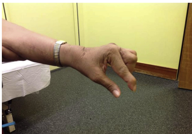
Fig 3 Case 2 postoperative hand positioning.

To our knowledge, this is the first publication of 3 cases describing the use of perioperative BoNT in patients with