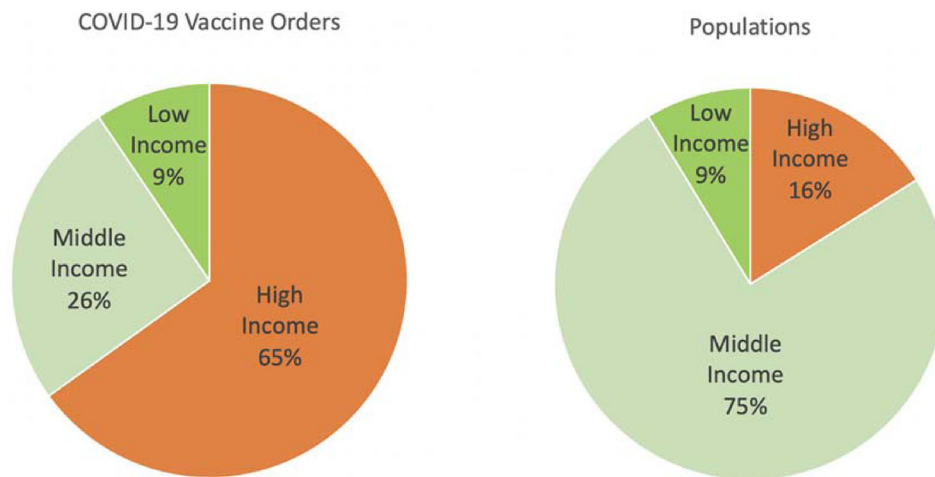
Figure 2. Global distribution of COVID-19 direct orders vs populations. Calculations were made using 2019 population figures released by the World Bank and the numbers of confirmed vaccine purchases published by The Duke Global Health Innovation Center.

workforce. Which countries should get the vaccines first? There are two schools of thoughts on the fair distribution of vaccines, namely equality and equity. Equality means each country should receive a number of vaccines proportional to the size of its population. Equity means vaccines should be allocated based on need. At the moment, there is a patchwork of different pathways for countries to access newly developed COVID-19 vaccines, including direct purchase, group financing and donations.