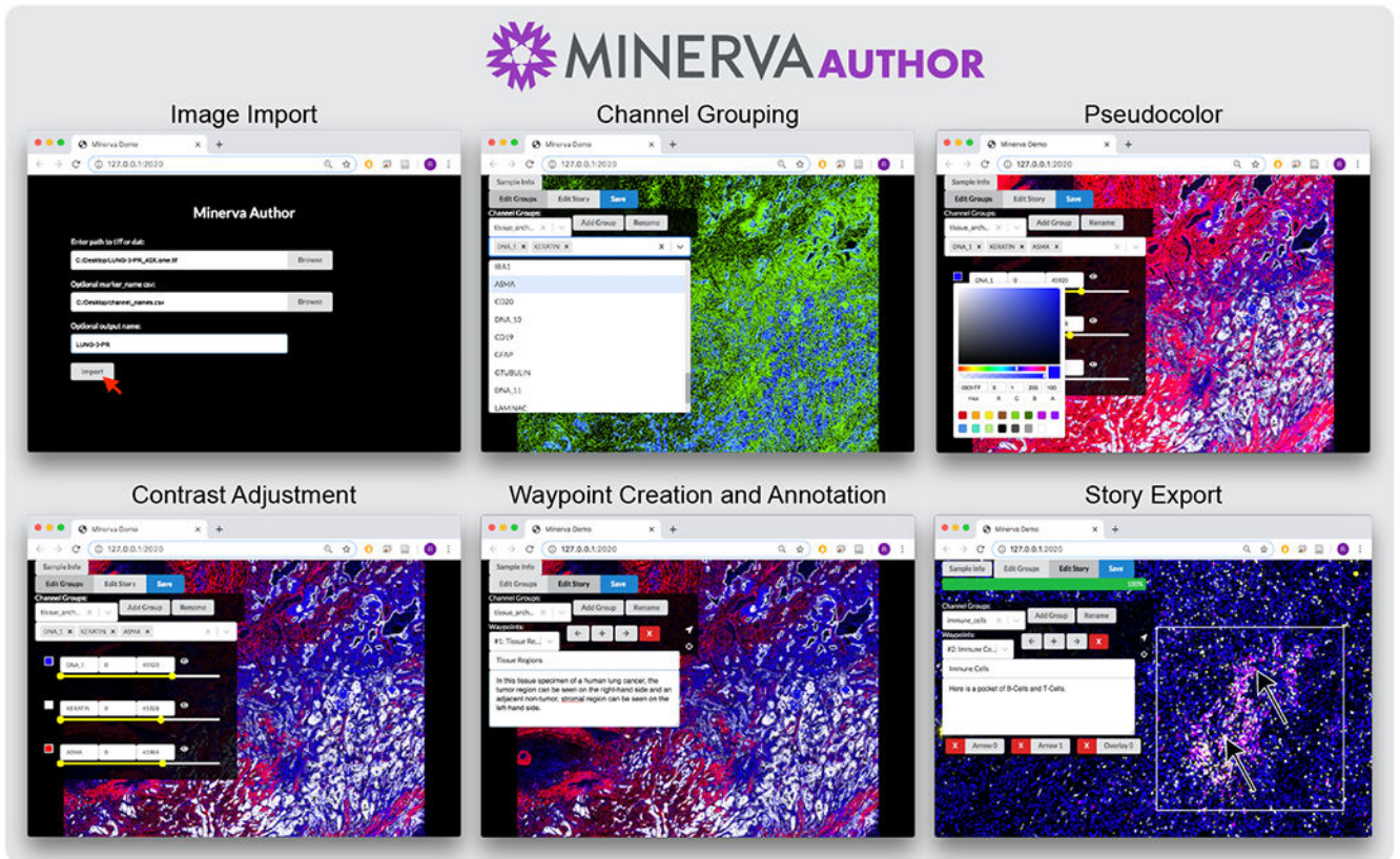
Figure 2: Minerva Author Interface.