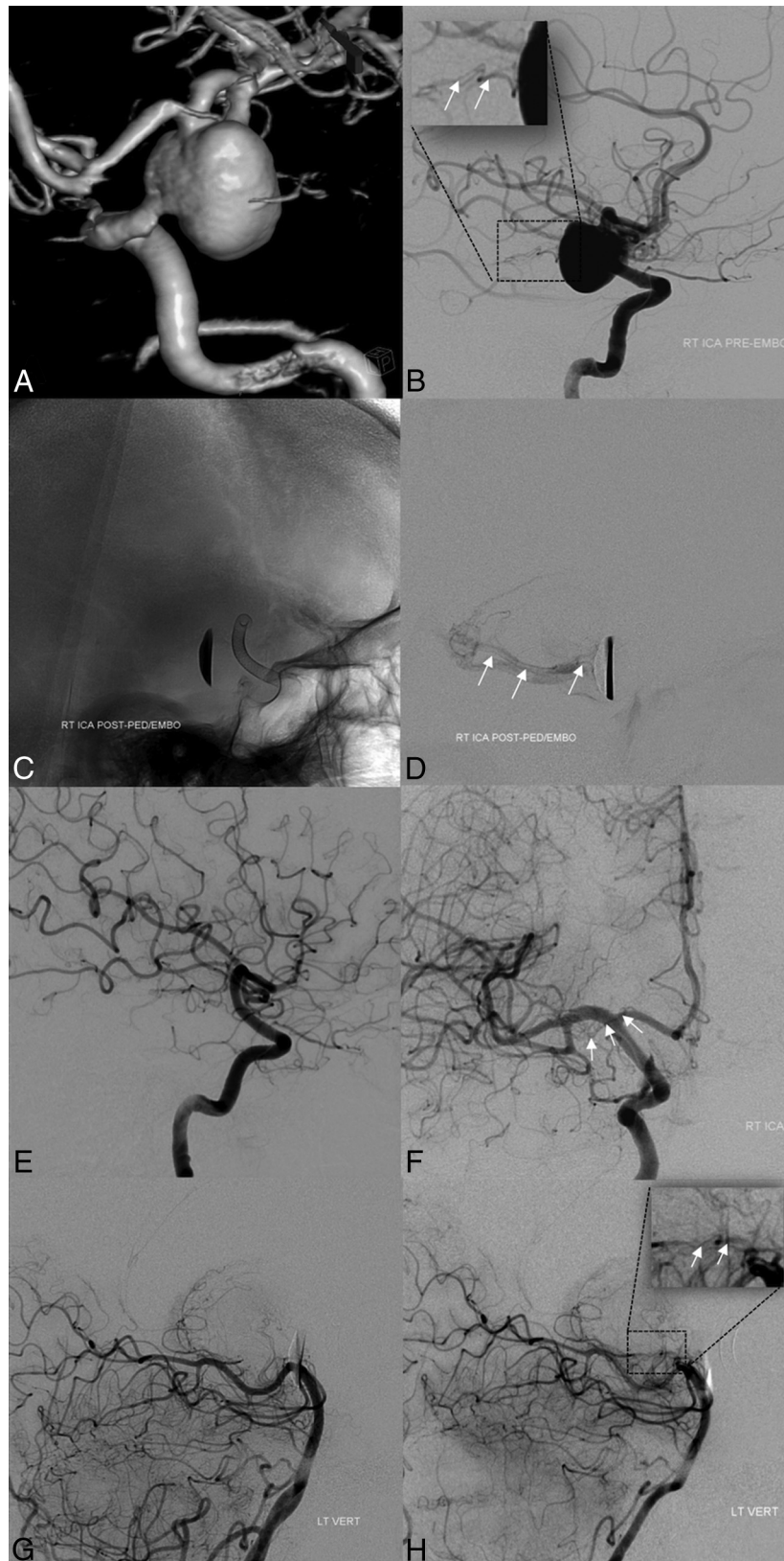
FIG 3. Baseline pretreatment 3D-DSA (A) and lateral projection DSA (B) demonstrating a large anterior choroidal artery aneurysm. Note the origin of the AchoA from the aneurysm fundus ( white arrows in inset, B). Immediate posttreatment images, after placement of PED, unsubtracted mask (C) and delayed image DSA (D), demonstrate coverage of the AchoA origin and residual antegrade opacification of the AchoA territory ( white arrows , D). Follow-up angiography (E and F) confirms complete occlusion of the aneurysm and AchoA origin; the AchoA is opacified retrogradely ( white arrows , F). Baseline pretreatment (G) and follow-up (H) DSAs of the left vertebral artery (lateral projections) demonstrate the collateral opacification of the AchoA through anastomoses with the posterior lateral choroidal artery at follow-up (inset in H, white arrows ; compare with the inset in B), not visualized at baseline (G).