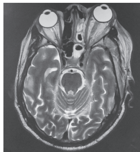
Fig. 1: MRI postcontrast T1W axial left sphenoidal and ethmoidal sinusitis with left cavernous sinus thrombosis and proptosis