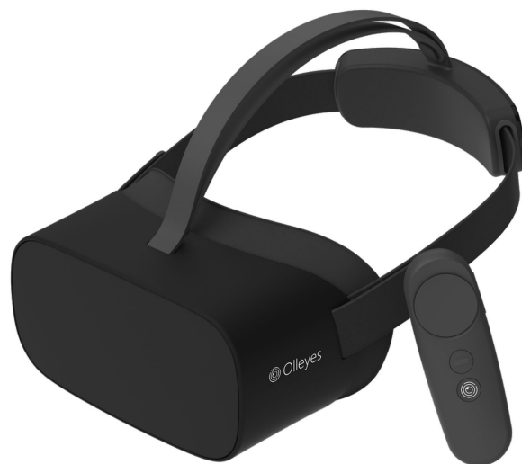
Figure 1. The VisuALL head mounted device (HMD) and Bluetooth connected handpiece.

The hardware includes three main components: a head mounted device (HMD) also known as a VR headset (Fig. 1), a web-capable device (laptop, phone, or tablet) and a Bluetooth connected handpiece (see Fig. 1). The HMD is powered by Pico (Pico Interactive, Inc., San Francisco, CA). It weighs 276 g and includes a Quad High Definition Liquid Crystal Display with a resolution of 3840 × 2160 pixels and a refresh rate