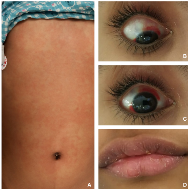
Figure 1 (A) Erythematous maculopapular rash over trunk. (B and C) Conjunctival congestion and subconjunctival haemorrhage. (D) Dry cracked lips.

first hour (N: <10)), CRP 18.4 mg/dL and D-dimers (865 ng/mL (N: 0–280 ng/mL)). His pro-brain natriuretic peptide (pro-BNP) was elevated (7690 pg/mL (N: 0–125 pg/mL)). Table 1 summarises the levels of inflammatory markers over the course of his illness.