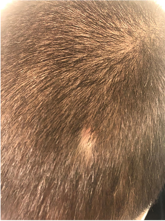
FIGURE 2 Alopecia areata on the scalp