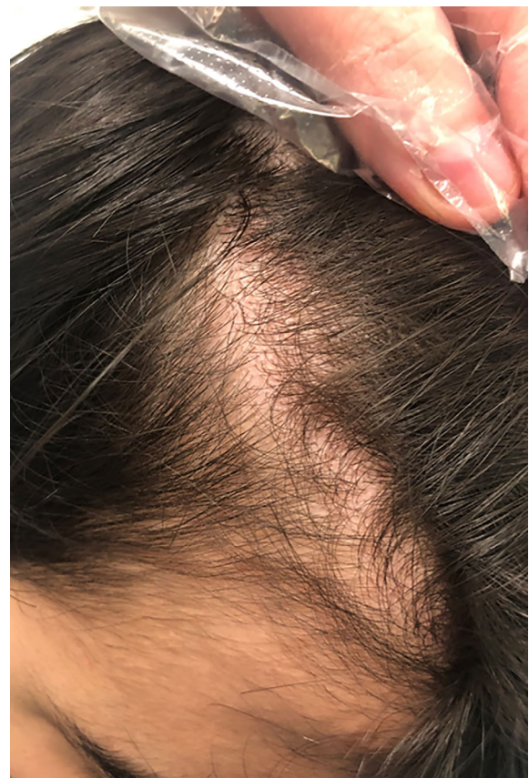
FIGURE 1 Reduction in hair volume with no visible alopecic patches

best of our knowledge, hair loss was not reported in MIS-C patients. We observed two different types of hair loss, AA and TE, in two pediatric patients with COVID-19-related MIS-C. Hair loss is a common postinfectious cutaneous manifestation of adults and it was reported by 24.1% of the patients. 2 Both AA and TE were observed in adults previously diagnosed with COVID-19. 3,4 The cause of hair loss in COVID-19 patients is unknown but stress and anxiety were the proposed precipitating factors. Severe COVID-19 infection with multi-system involvement may also cause anxiety and stress that may lead to AA and TE in pediatric population.