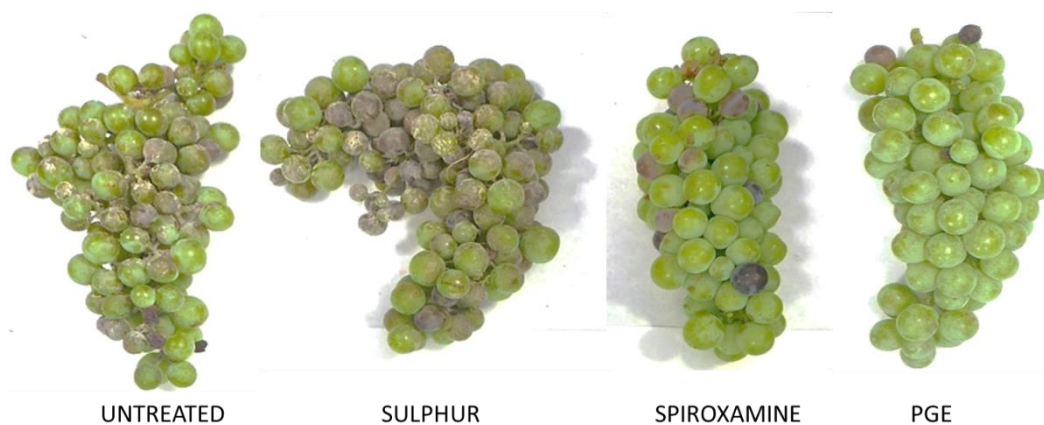
Figure 2. Representative results of trials conducted on grapevine (cv. Aglianico) to control the powdery mold fungus Uncinula necator . Treatments were made on 8 July 2016 with wettable sulphur (TIOVIT ® ) at 2 g/l, Spiroxamine (PROSPER ® ) at 0.8 mL/l and PGE at 6 g/l. Untreated grapes were used as control. Photos were made at the beginning of the grape veraison, on 17 August 2016.

Recently, the use of an ethanolic PPE to control the grape powdery mold fungus Uncinula necator has been patented, highlighting the possible use of PPEs also against biotrophic pathogens (Figure 2) [66]. On grapevine cv. Aglianico, three treatments at intervals of 15 days, during the phenological phases of fruit set, pre-bunch closure and bunch closure, reduced the disease incidence by 71%, reaching an efficacy equal to that of the systemic fungicide Spiroxamine (Prosper ® , Bayer Crop Science Italy).