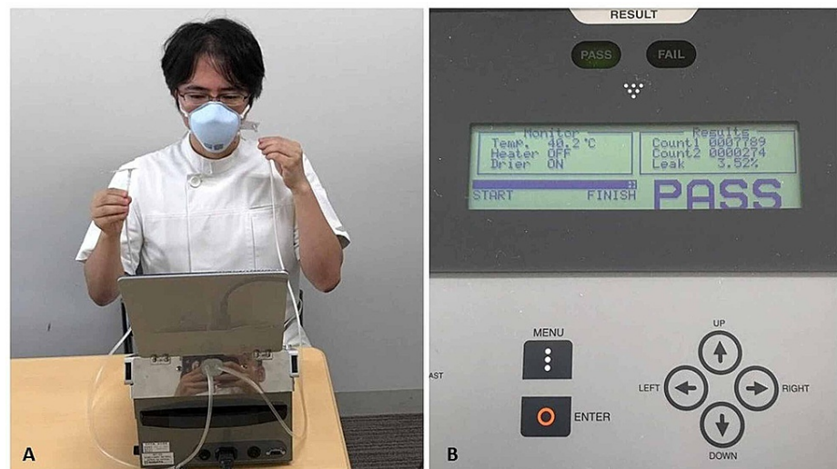
FIGURE 3: Fit test using the quantitative respiratory fit testing system

A pass was defined as a leak rate of less than 5% (Figure 3B).