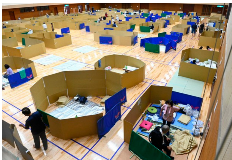
Figure 2. Public gym in Yatsushiro, Kumamoto Prefecture (Mainichi, 2020).

The implications of dispersed evacuation include the need to designate more evacuation centers, identify isolation facilities for infected individuals, and implement additional health measures, including stockpiling of additional emergency supplies (e.g., facemask, disinfectants, and thermometers).