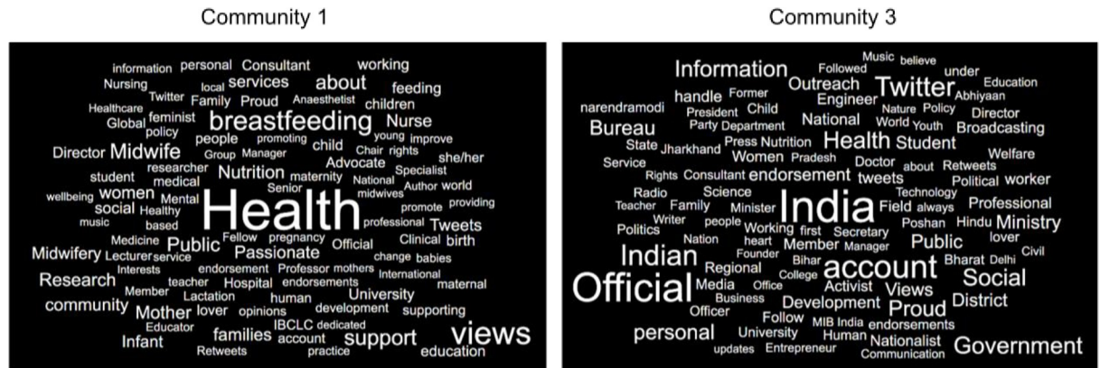
Fig 2. Profile description word clouds for users in Community 1 and 3 of the campaign network.

https://doi.org/10.1371/journal.pone.0249302.g002