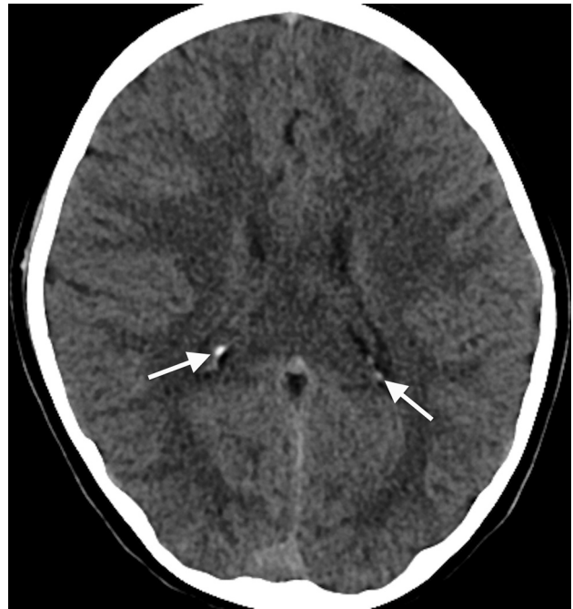
FIG 3. Axial head CT image from an 8-year-old child obtained for seizure, at the level of the lateral ventricular atria, depicting choroid plexus glomus calcifications ( arrows ).

The epithalamus comprises the pineal gland and habenular complex. We chose to examine the prevalence of epithalamic, pineal,