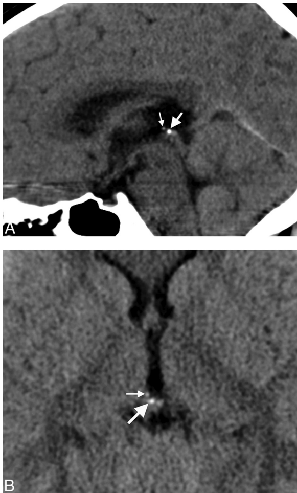
FIG 2. A, Midline sagittal head CT image from an 8-year-old child obtained for headache, demonstrating calcifications in both the pineal gland ( large arrow ) and habenular complex ( small arrow ). Habenular calcifications are centered anterosuperior and lateral to the pineal base. B, Axial head CT image through the epithalamus from an 8-year-old child performed for headache, showing pineal gland ( large arrow ) and habenular ( small arrow ) calcifications. Habenular calcifications are centered anterolateral to the pineal base.