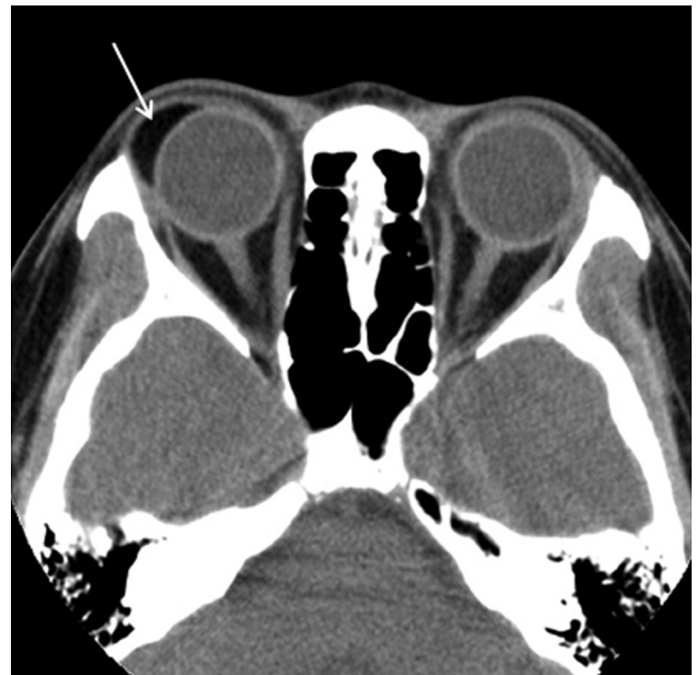
Fig 3. Dermalipoma in a 25-year-old woman. Precontrast axial CT scan demonstrates the crescent-shaped fatty mass at the superotemporal aspect of the right epibulbar area, which abuts the lateral wall of the eyeball, anterior to the insertion of the lateral rectus muscle and medial to the lacrimal gland (arrow). It has no connection to the intraconal fat. The lesion also contained a focal soft-tissue strand in the inferior portion (not shown).

Both subconjunctival fat prolapse and dermolipoma usually occur in the lateral canthal area beneath the temporal or su-