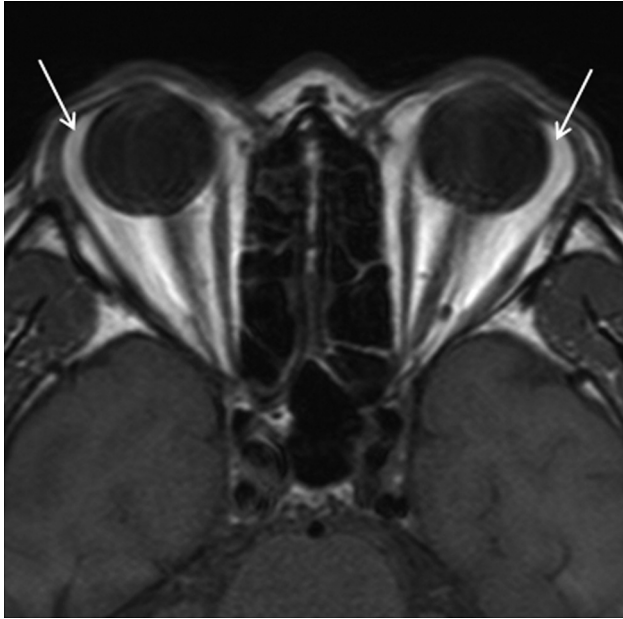
Fig 1. Bilateral subconjunctival fat prolapse in a 61-year-old man. Precontrast axial T1-weighted MR image demonstrates the herniated fat at the superotemporal aspect of bilateral epibulbar area, continuous with the intraconal fat, which extends anteriorly between the lateral wall of the globe medially and the lateral rectus muscle and the lacrimal gland laterally (arrows).