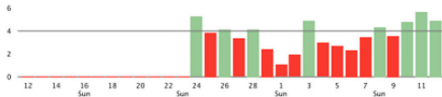
Figure 1. Example of a standard positive airway pressure compliance report depicting 30 nights' objective downloaded data from automatic positive airway pressure device. AHI = apnea-hypopnea index; AI = apnea index; EPR = expiratory pressure relief; HI = hypopnea index; RERA = respiratory effort-related arousal.