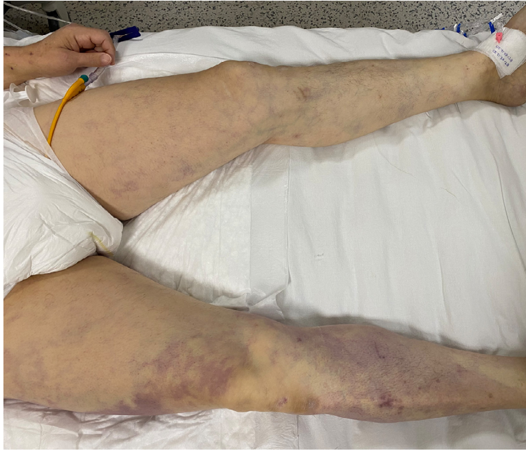
Fig. 1. Clinical appearance of acute limb acute limb ischemia in a hospitalized patient with COVID-19 (Patient #2).