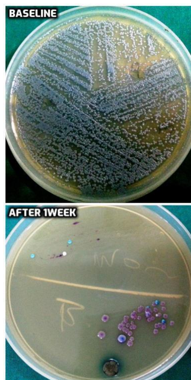
Figure 1. Colony forming units in HiChrome agar at the baseline and 1-week time after using Woodfordia leaf mouthwash

The identification of Candida species was accomplished using HiChrome Candida differential agar (HiMedia Lab, Mumbai, India). In this medium, the observation of green, metallic blue, and cream or white colors were regarded to denote C. albicans , C. tropicalis , and C. glabrata , respectively (Figure 1).