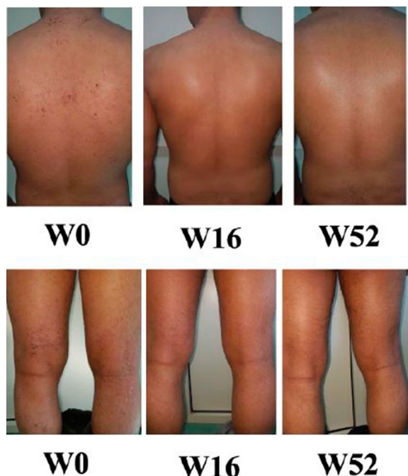
Fig. 2 Improvement of a patient from baseline to 16 and 52 weeks of treatment with dupilumab

while the CAFÉ and CHRONOS studies assessed the drug administered concomitantly with topical corticosteroids, at 16 and 52 weeks of treatment, respectively [3, 4]. Currently, data regarding its daily practice setting, real-world effectiveness and tolerability up to 52 weeks are limited [5–7].