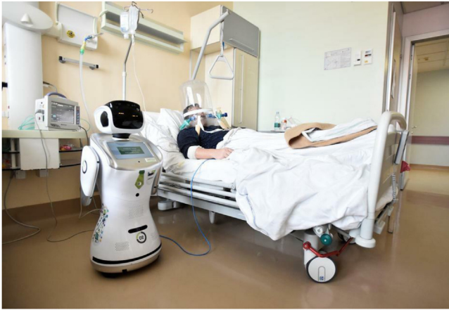
Fig. 1 – Medical robots are used to take-care and monitor patients.