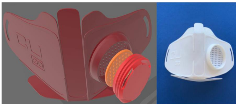
Fig. 5 – 3D Printing Technology is used for manufacturing PPE's. 26

before making decisions further for clinical assessment. 29 In the “COVNet” detection method the imaging system was performed for different standard imaging protocols. Therefore, it could also be applied to study and detect viral pneumonia infection in chest radiographs. 30 The two major limitations of the use of Chest CT. First, the health systems during an epidemic may be overburdened, which may limit the timely interpretation of the CT by radiologists. Second, the morphology and severity of pathologic findings on CT are variable. In particular, mild cases may have few if any abnormal finding on the chest CT. 28