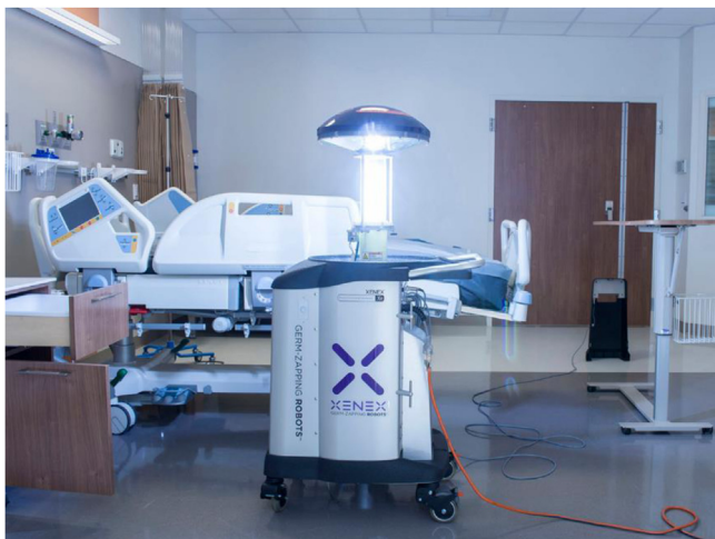
Fig. 2 – Ultra-violet robots are used for sterilizing purposes.

temperature, blood pressure, and pulse rate, and regular monitoring using a vision algorithm 11,12 (Fig. 1). In addition to this, these robots help deliver medicines and food for isolated and quarantined patients in hospitals and health care centers. 13 Therefore, we could monitor, study the condition of patients, and categorize the stages of disease under treatment and doctors could attend the patients based on the severity. During COVID-19, mobile robots were most helpful in delivering food and medicines to isolated patients in hospitals to secure the health of frontline workers including doctors. 35,36