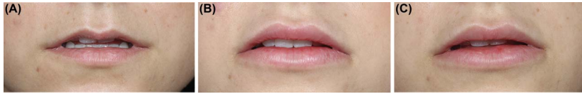
Figure 3. Subject photographs. Lip appearance of a 31-year-old woman at (A) baseline, and at (B) Week 8 and (C) Week 48 after injection of HA RK (total volume: 1.0 mL in upper lip; 1.5 mL in lower lip).

The most commonly reported treatment-related TEAEs (occurring in \geq 5\% of subjects) were injection-site mass (HA RK : 10%; control: 11%), injection-site bruising (HA RK : 8%; control: 10%), and injection-site nodule (HA RK : 5%; control: 7%). All of the most commonly reported treatment-related TEAEs were mild, except one event of moderate injection-site bruising.