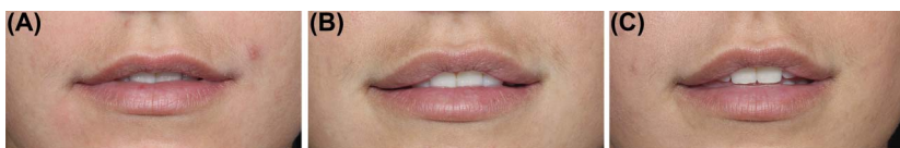
Figure 4. Subject photographs. Lip appearance of a 29-year old woman at (A) baseline, and at (B) Week 8 and (C) Week 48 after injection of HA RK (total volume: 0.85 mL in upper lip; 0.6 mL in lower lip).

The authors acknowledge the contributions of Drs. Kimberly Butterwick (Cosmetic Laser Dermatology, San Diego, CA), Lisa