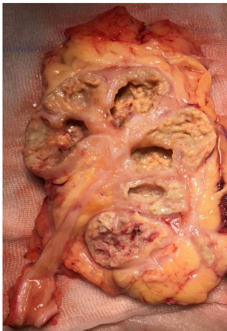
Fig. 1 Gross examination shows enlarged kidney and yellow nodules in the renal parenchyma

There are scarce data on antibiotic treatment used in XGP. It has been reported that one-third of patients have sterile urine and one-fourth have mixed growth in urine culture. The most frequent microorganisms isolated in urine culture are P. mirabilis , followed by E. coli . In the study of Dwivedi et al., these microorganisms were isolated in 23% and 11.5% of cases, respectively [7].