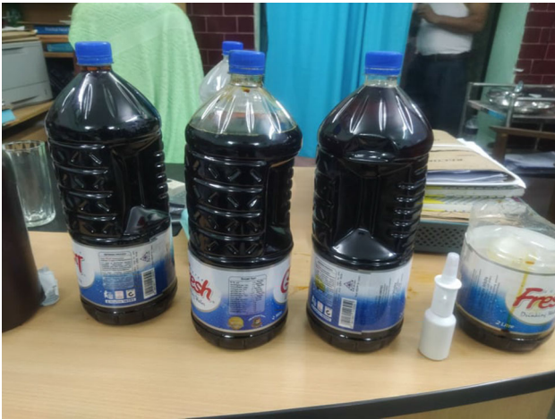
Fig. 3 PVP-I solutions prepared for gargling and Oro-nasal spray