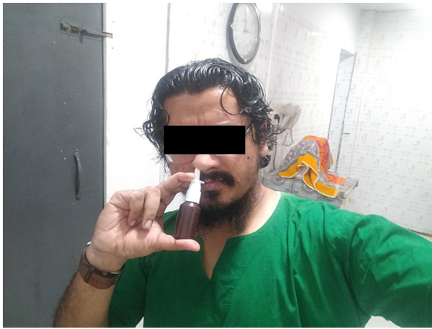
Fig. 10 Use of PVP-I Oro-Nasal spray (Post exposure). (N.B. Please ignore the label of container)