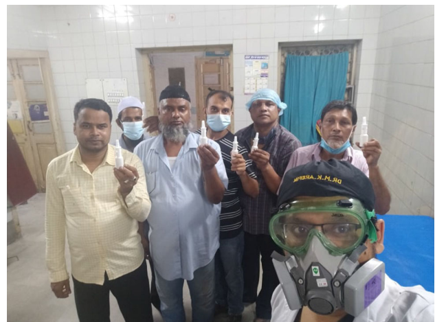
Fig. 1 HCWs of Dept. ENT & HNS, DMCH holding the PVP-I Oro-Nasal spray

I personally use it by myself in my private practice, in all of my surgery, all of the OPD procedures. Irrespective of COVID-19 status, either RT-PCR test positive or