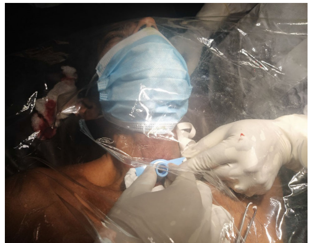
Fig. 8 During Emergency tracheostomy in COVID-19 pandemic (by ‘POLIDON’ approach)