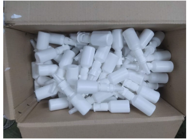
Fig. 4 Containers of PVP-I Oro-Nasal spray