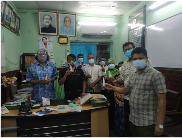
Fig. 2 Doctors and other HCWs of Dept. ENT & HNS, DMCH holding the PVP-I Oro-Nasal spray