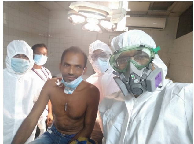
Fig. 7 Immediately after emergency tracheostomy