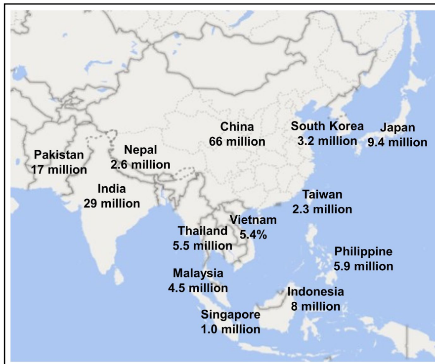
FIGURE 1 Prevalence of obstructive sleep apnea with AHI \geq 15 events per hr in the population aged 30–69 years by country or region