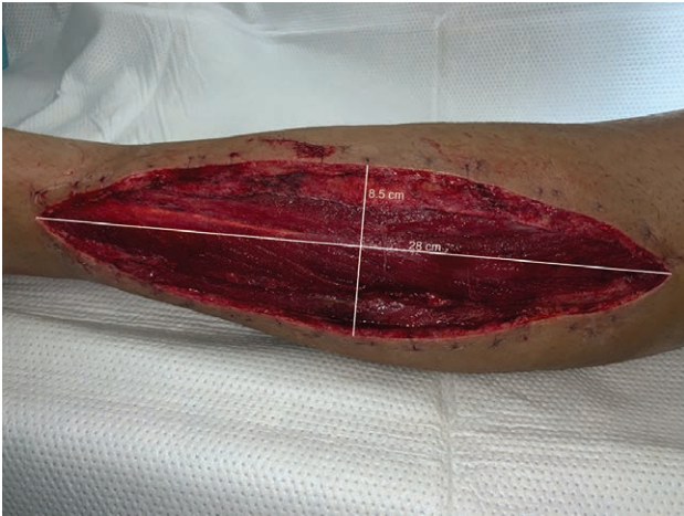
Fig. 1. Photograph of the patient showing initial left lateral leg wound measuring 28 cm (length) \times 8.5 cm (width).

partial closure with retention sutures and NPWT. This closure method takes advantage of the biological and mechanical creep employed by the rubber band and vessel loop techniques as well as NPWT to facilitate wound healing.