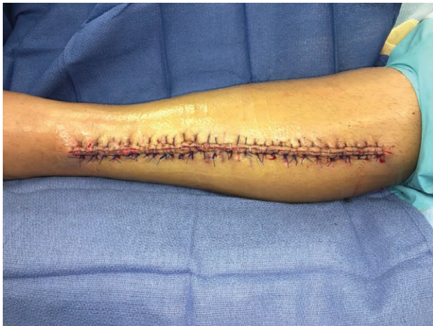
Fig. 3. Picture depicting DPC achieved 9 days after placement of retention sutures.