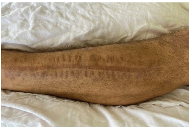
Fig. 4. Photograph of the patient showing final healed incision 1 year after definitive closure.

0-strength sutures allowed greater tissue reapproximation compared with our experience with the shoelace/rubber band method. Unlike the shoelaces, retention sutures (1) do not require tightening, (2) are less likely to break, (3) do not require staple removal, and (4) reduce exposure of the wound bed to a nonsterile environment. NPWT facilitates wound healing via a variety of mechanisms, including removal of edematous fluid, promotion of wound bed contraction, and enhancement of the inflammatory response. 13–15 This case study and report of technique should prompt further studies investigating the objective benefits of this novel method to achieve DPC following fasciotomy.