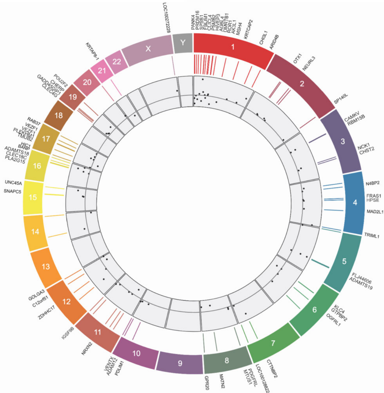
Figure 3: Circular map of genomic distribution among differentially methylated CpGs. From the outmost ring inward, the map shows gene names, chromosome number, position within the chromosome, and effect sizes among Average Causal Effects (below the gray line is a negative effect size and above the line is a positive effect size).

diagnosed with adrenoleukodystrophy, which is a neurodegenerative disorder characterized by dysregulated long-chain fatty acid metabolism—a pathologic process associated with exposure to traffic-related air pollutants [41]. We found increased DNA methylation of the UNC45A gene associated with DE exposure but in bronchial cells. In addition, DNA methylation of this gene in whole blood samples has been associated with FEV 1 /FVC, a marker of lung function, among never smokers [42].