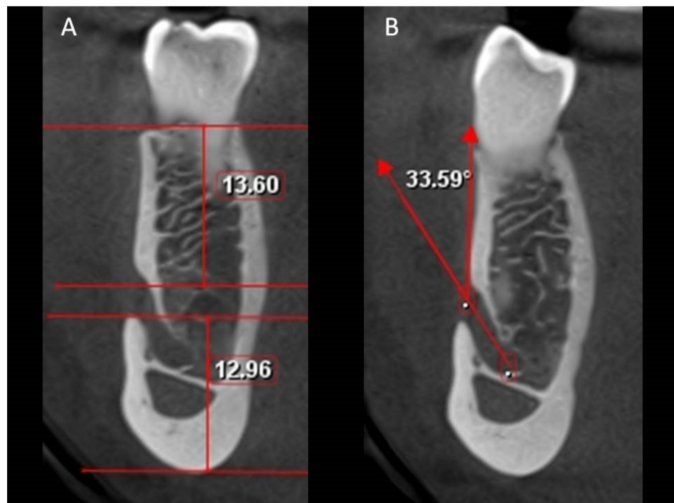
Figure 2. Coronal view showing the distance from the mental foramen to the upper and lower border of the mandible (A) and angulation between the mental canal and the buccal cortical bone superior to the mental foramen (B).