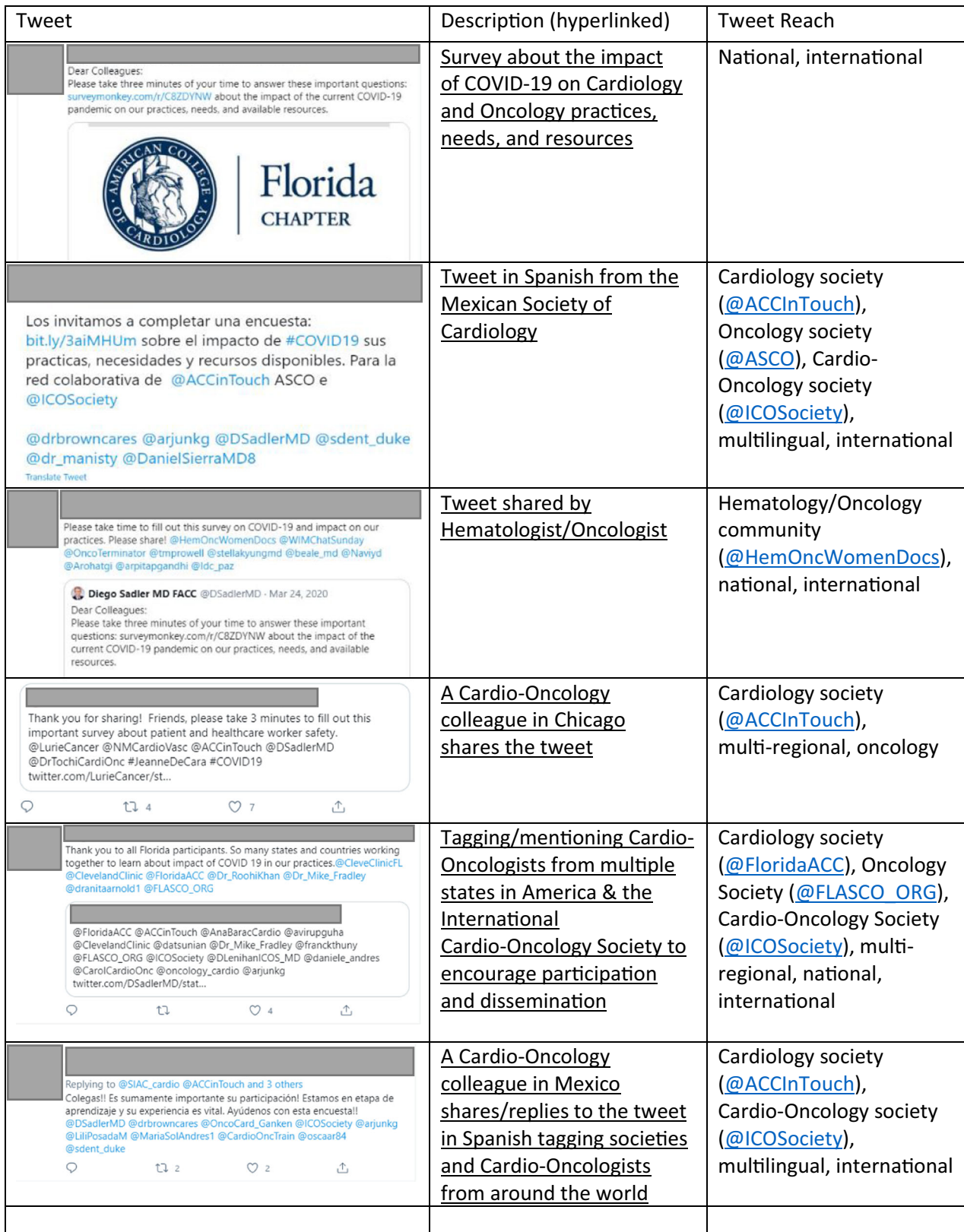
Table 2 Tweets disseminating the survey in English and Spanish nationally and internationally