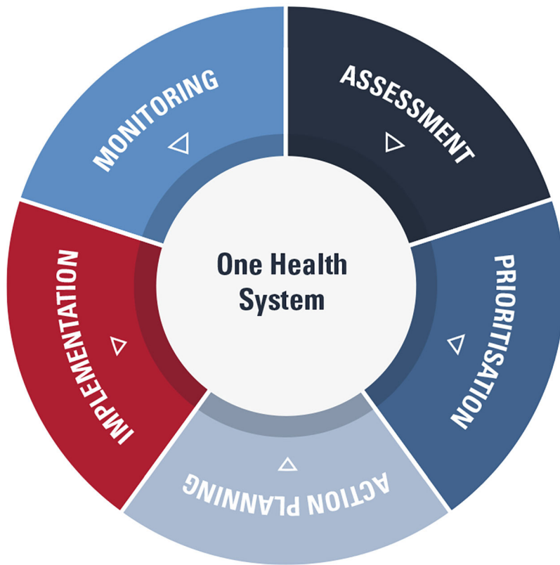
Fig. 2. Overarching conceptual framework