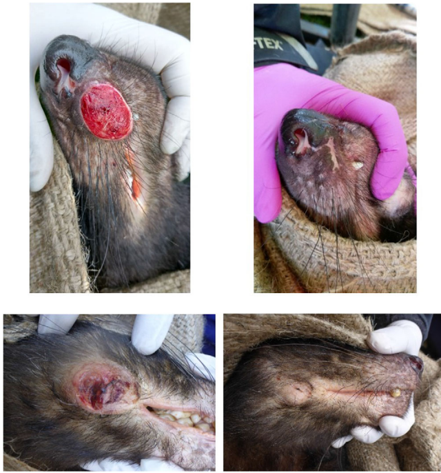
Figure 1. Two wild Tasmanian devils with DFTD (left) and after natural tumor regression 3 months later (right).

rescue (Grueber et al. 2019) are being tested, as are field immunizations aimed at stimulating an adaptive immune response (Pye et al. 2018). However, the epidemiological and evolutionary consequences of introducing naïve individuals from insurance populations into diseased populations have not been evaluated comprehensively, thus, current management is unlikely to prevent transmission. Darwinian principles, host-pathogen coevolutionary theory, and the growing literature on ecological and evolutionary principles in oncology (Korolev et al. 2014) suggest that silver bullets are unlikely to result in disease eradication. We considered evolutionary biology and ecology of host-pathogen interactions to highlight why the role of natural selection in host adaptations to cancer should be considered in the management of this species and other epizootics.