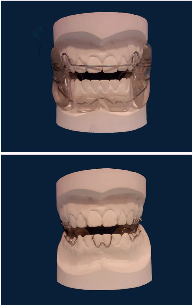
Figure 1. Appliance types used in this study: (a) FR2 and (b) MTB.

use. 10 The overjet and the molar relationships were also noted.