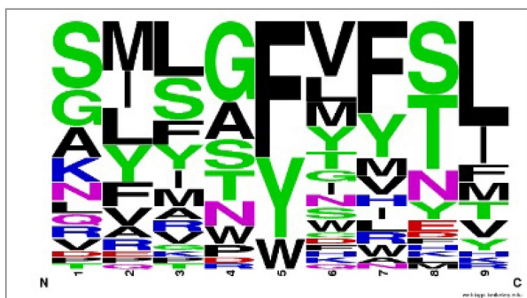
Fig. 3 Frequency logo for the peptide antigen family of homologous template peptide 1oga (GILGFVFTL) of top hit peptide (SIAYTMSL)