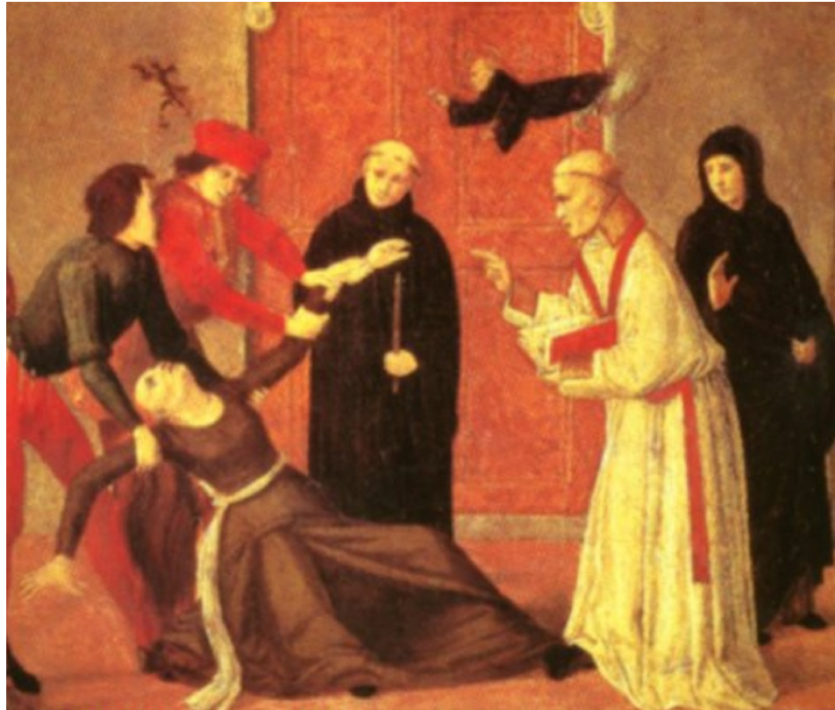
FIGURE 2: Saint Severin curing a woman of the 'falling sickness demon'.

Meister des Heiligen Severin. Circa 1300.