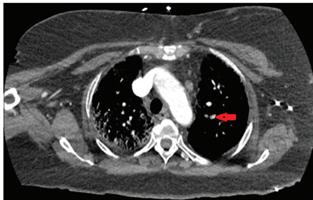
Figure 2: Computed tomography angiogram which showed a pulmonary embolus involving the segmental branch of the left upper lobe pulmonary artery