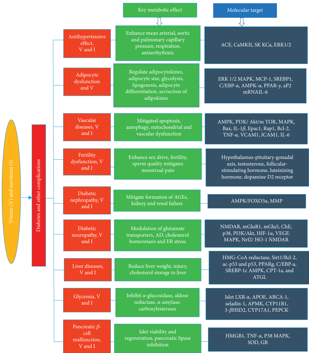
FIGURE 3: Schematic diagram of metabolic effects and molecular targets of vitexin and isovitexin in diabetes mellitus and its complication. V, vitexin; I, isovitexin.

antiplatelet activity and suppressed arachidonic acid, collagen, thrombin, and platelet-activating factor in rabbit platelets [205].