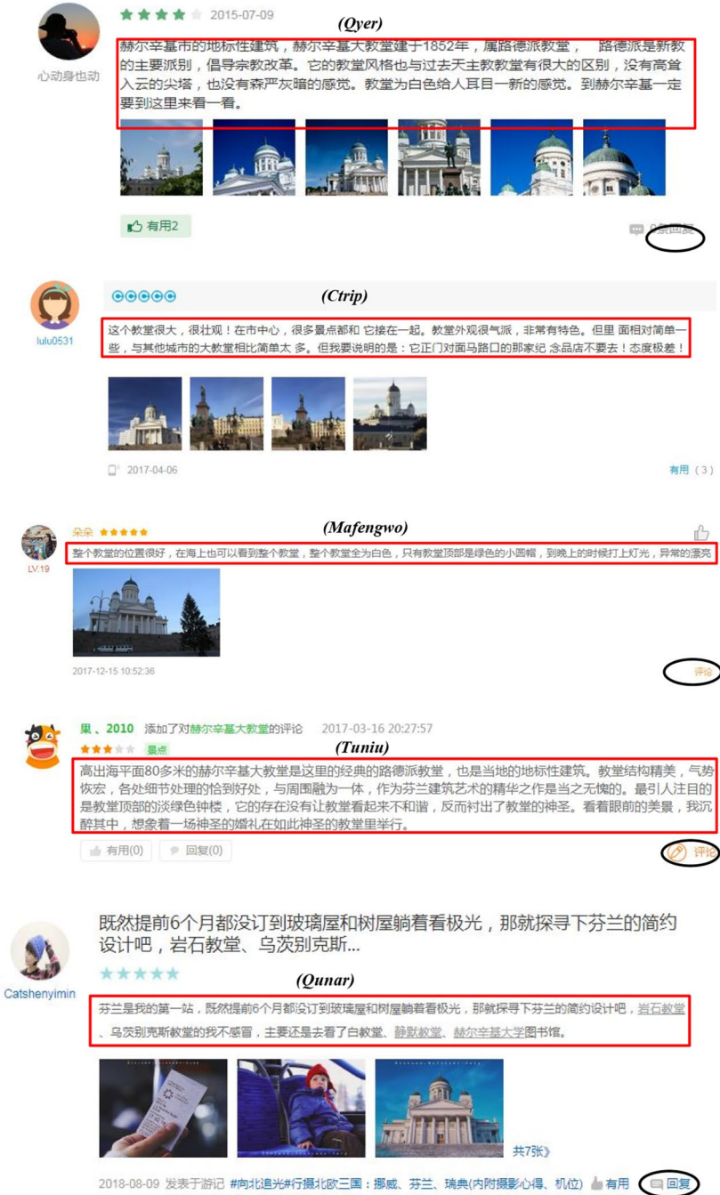
Fig. 2 The format of the OTRs on Qyer, Ctrip, Mafengwo, Tuniu, and Qunar