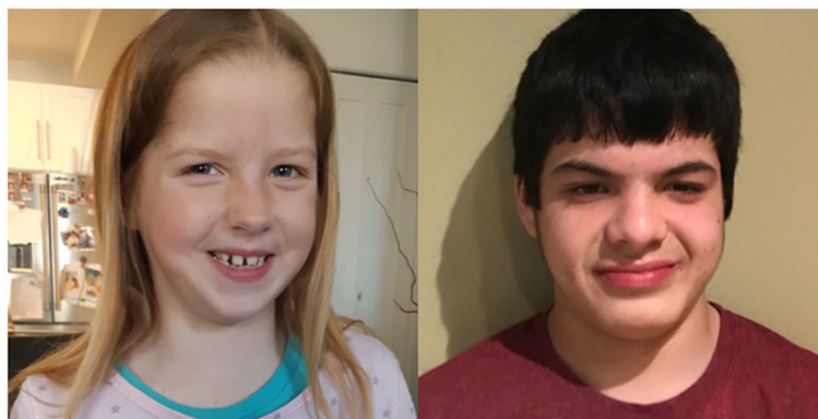
Fig. 1 Facial characteristic of two individuals with FOXP1 sequence variants, ages 9 and 15, including prominent forehead, wide nasal bridge with a broad tip, down slanting palpebral fissures, mild ptosis, thick vermilion, and wide spacing between teeth

Speech and language therapy, occupational therapy, and behavior therapy are often critical components to treatment plans. We recommend comprehensive evaluations by therapists with experience treating individuals with neurodevelopmental disorders to assess need and frequency of services required. Augmentative and alternative communication evaluations should be provided to all individuals who are nonverbal or minimally verbal. Applied behavior analysis (ABA) is recommended to