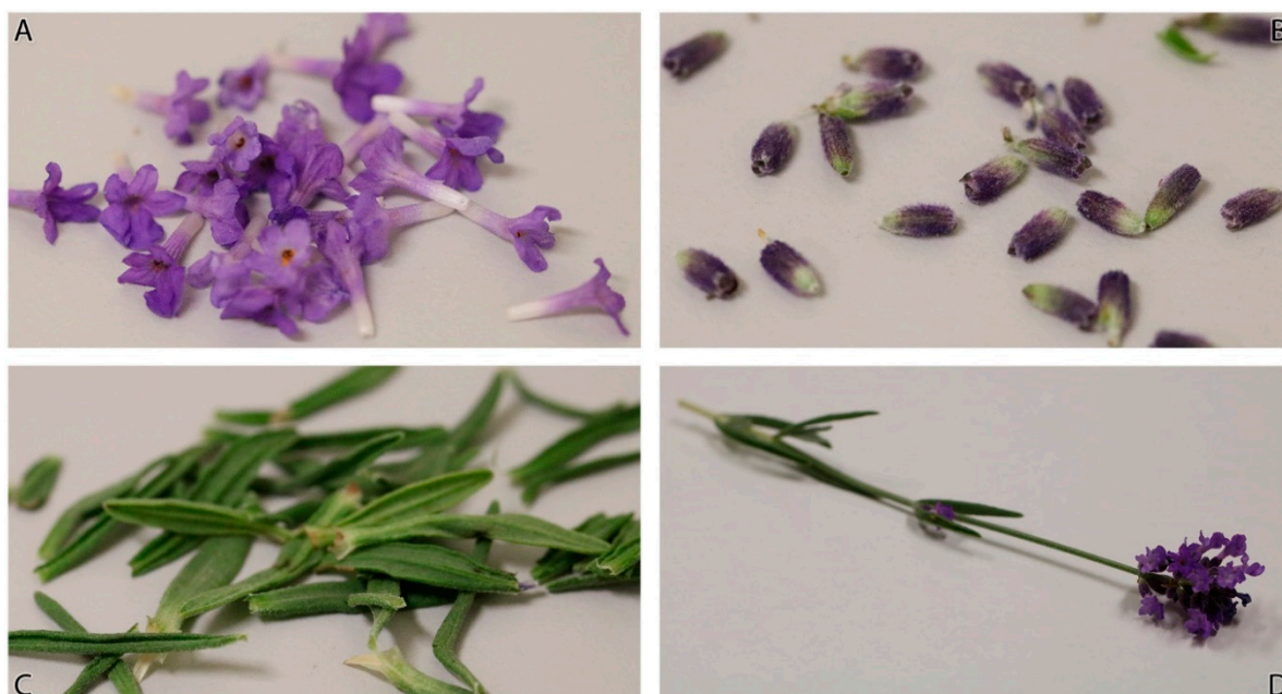
Figure 1. Portions of Lavandula angustifolia used: (A) corolla, (B) calyx, (C) leaf, (D) flowering top.

Table 1. Aromatic profile of L. angustifolia essential oil from the corolla, calyx, leaf, and whole flowering top. Each reported value below represents the average of three essential oil samples distilled from each portion. Each essential oil sample was analyzed in triplicate. Values less than 0.1% are denoted as trace (t) and those not detected in a portion of the plant as not detectable (nd). Unidentified compounds less than 0.5% are not included. KI is the Kovat's Index value obtained using a linear calculation on DB-5 column [38]. Relative area percent was determined by GC-FID.