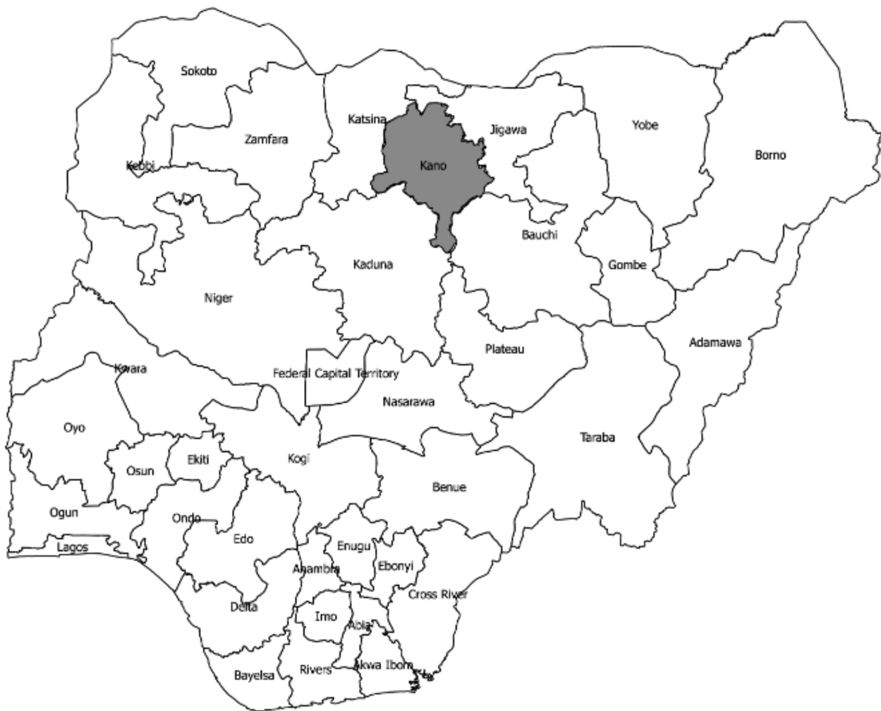
Figure 2. Map of Nigeria showing Kano highlighted in the north-western region.

The relationships between our study variables are described using the direct acyclic graph in Figure 1.