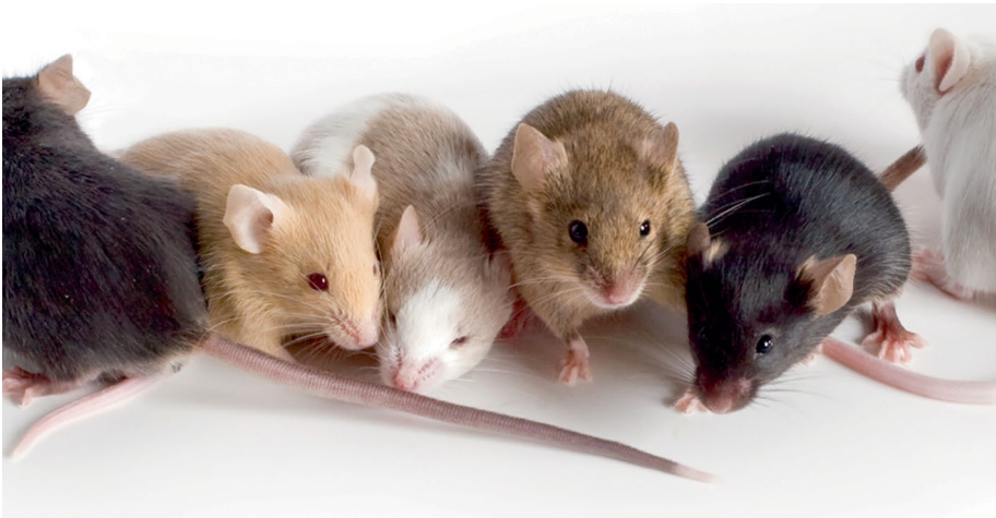
The Jackson Laboratory is working to diversify current mouse models to make them better represent variability between people. These mice could help to model the puzzling diversity of long-COVID symptoms.

eQTL analysis on a number of different tissue types.