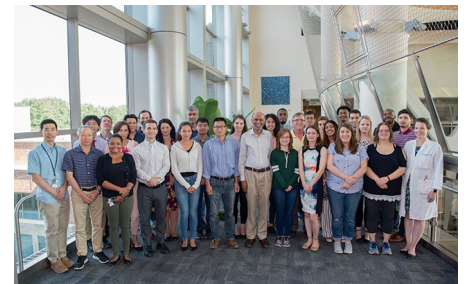
The NIH has launched a $1.15 billion initiative focusing on long COVID. In samples from people with long COVID, the NINDS lab of Avi Nath is looking for viral remnants or viral signatures.

The viral genome in these instances reveal two mutation types, he says. One affects the matrix protein, and it’s a change