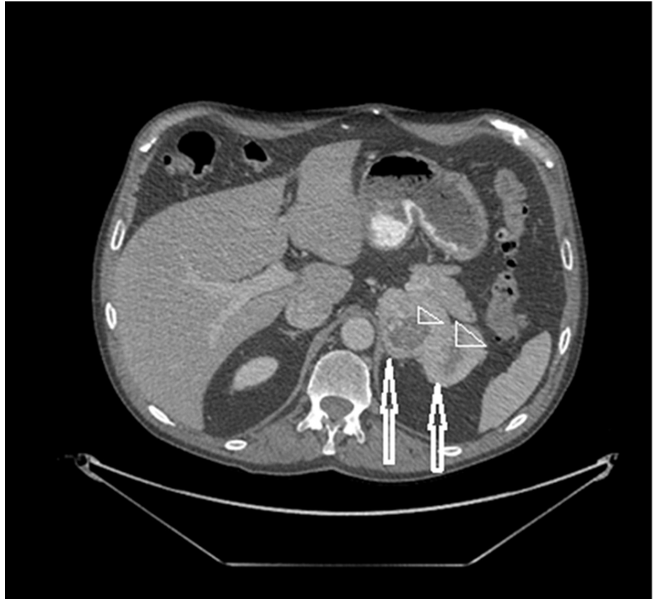
FIGURE 1: CT scan of the abdomen

vital signs, no stigmata of Cushing's syndrome, and normal body mass index (BMI). Urine analysis for catecholamines and cortisol were within normal limits, and so were serum aldosterone-to-renin activity, electrolytes, and dehydroepiandrosterone sulfate (DHEA-S) levels. A repeat CT scan of the abdomen done four months after the first one revealed a bi-lobed heterogeneous mass in the left adrenal gland measuring 9 x 5.5 cm with a central low density likely indicating necrosis (Figure 1).