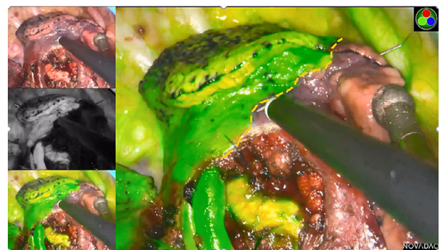
FIGURE 1 The intersegmental boundary line was clearly identified via the near-infrared fluorescence imaging with the intravenous indocyanine green method using the PINPOINT endoscopic fluorescence imaging system

During the operation, the reconstructed 3D images were displayed on another computer in front of the thoracoscopic screen to guide the observation of segmental