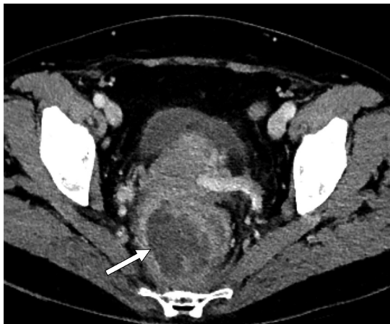
FIG 1 Contrast-enhanced abdominopelvic CT scan. White arrow indicates a perirectal abscess.