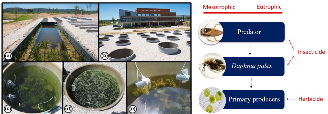
FIGURE 1 Mesocosm facilities (left) and experimental setup (right). Biodiversity lagoon used to fill in the mesocosms (a), outdoor mesocosms (b), mesotrophic mesocosms (c), eutrophic mesocosms (d), detail of experimental cages containing Daphnia pulex alone and Daphnia pulex with one individual of Notonectidae sp (e).

By testing these species and stressor combinations, we aimed to gain mechanistic understanding on the effects caused by multiple stressors on freshwater populations. We hypothesized that direct toxic effects of chlorpyrifos on D. pulex and the indirect effects of diuron caused by a decrease in food availability will decrease D. pulex fitness, increasing its population susceptibility to the predator. Moreover, we hypothesized that the susceptibility of D. pulex will be larger when chlorpyrifos and diuron co-occur, and we expected to see an influence of the trophic status on the response to the single and combined effects of the evaluated pesticides.