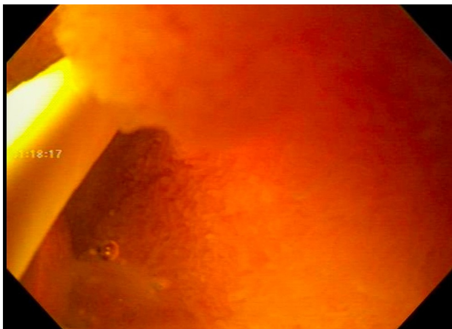
FIGURE 2: Duodenal aspirates to evaluate for small intestinal bacterial and fungal overgrowth

Duodenal biopsies came back with no evidence of celiac disease. Random gastric biopsies came back negative for H. pylori . Her colonoscopy with random colon biopsies was also negative for any evidence of microscopic colitis and inflammatory bowel disease (IBD). Subsequently, a glucose hydrogen breath test was positive for small intestinal bacterial overgrowth (SIBO). She was treated with Rifaximin 550mg TID x 14 days twice with only partial relief of symptoms. Due to persistent symptoms, she underwent repeat upper endoscopy with planned duodenal aspirates to evaluate and direct treatment of SIBO and small intestinal fungal overgrowth (SIFO) via culture and sensitivity as well as small bowel biopsies to evaluate disaccharidase deficiency assay (Figure 2). Duodenal aspirates were obtained by placing a 6 French liguory catheter into the channel of the gastroscope into the 3rd portion of the duodenum under aseptic precautions, including wearing sterile gloves by nurse and physician. Approximately 3 cc of bile-tinged duodenal fluid were aspirated and sent to microbiology for aerobic, anaerobic, and fungal cultures.