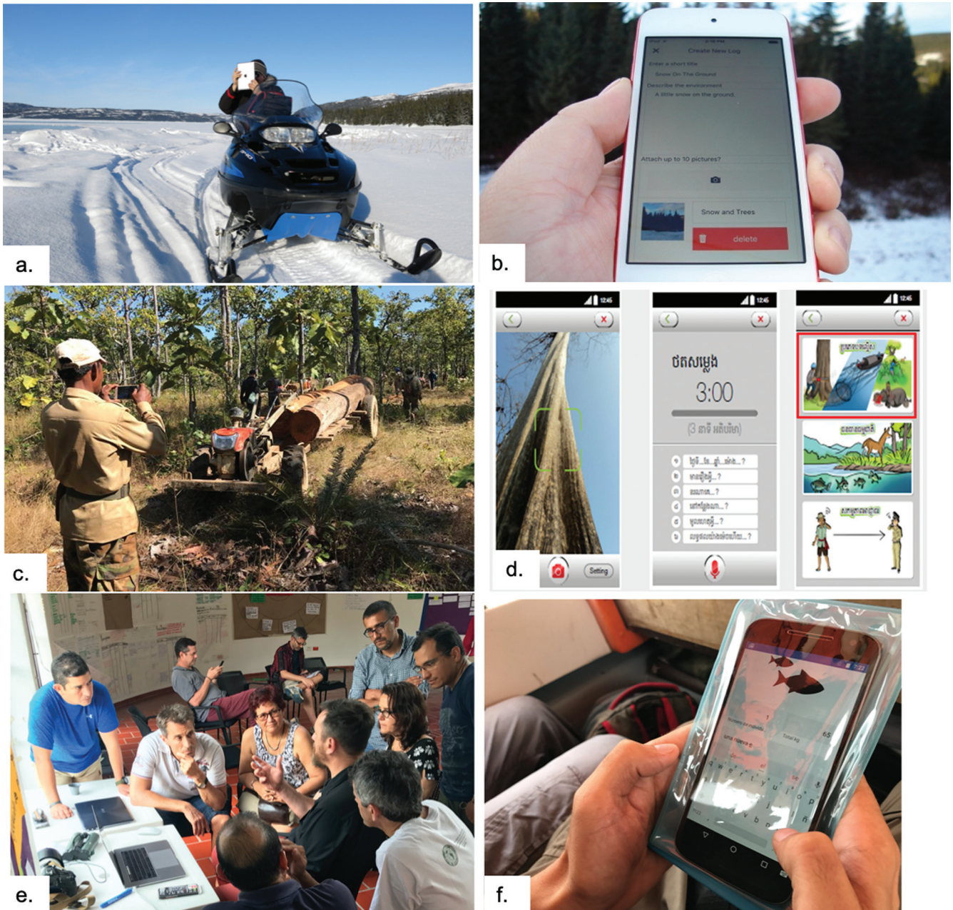
Figure 1. From the Arctic to the forests of Cambodia to the Amazon, digital platforms including smart phone apps facilitate collection and sharing of community observations. (a) Monitoring the land in Nunatsiavut, Labrador, an observer takes a picture with the eNuk app on his iPad. (b) The eNuk app on a cell phone. (c) A community patrol from Prey Lang documents an illegal timber harvest using the It's Our Forest Too app. (d) The It's Our Forest Too app allows observers to take photos, record audio, and select from pre given categories such as observations of illegal activities, observations of wildlife, and interactions with officials and offenders. (e) Participants in a design workshop for the Ictio app, which collects observations of fish in the Amazon basin. (f) the Ictio app in action.