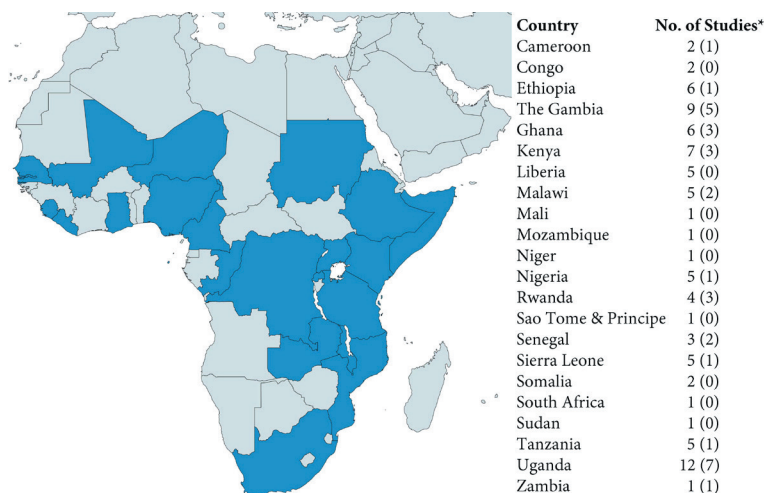
Figure 2. Countries represented in available studies. *First number indicates number studies in total, including studies which included multiple sites. Number in parenthesis indicates number of single-site studies.