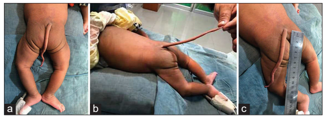
Figure 1: (a-c) True tail caudal appendages (case 1)

A 11-month-old male infant, delivered vaginally from nulliparous mother with uneventful antenatal period presented with painless swelling at the lower back which increases in size gradually. On examination, single pedunculated soft-tissue (caudal appendages) mass approx. 4 cm × 2 cm is located at midline in the lumbosacral region [Figure 3a-c]. There is slight deviation of gluteal cleft towards left. No bony or cartilaginous element was palpable. Neurological and physical developments were normal for his age. Head circumference was normal. There were no other associated anomalies. Ultrasound of the lower back and brain was normal, and X-ray lumbosacral spines are normal. However, spinal MRI was not performed due to financial constrain. The patient was positioned prone, and transverse elliptical incision was given. Skin and subcutaneous tissues were dissected. There was no evidence of tail leading inward from the appendage. Thoracolumbar fascia was found intact. Complete excision was done. Cut section shows yellowish fatty tissues. Microscopically, adipose tissues, collagen fibres and vascular channels of various size were observed. Post-operative period was uneventful with acceptable cosmetic scar. Now, the patient is 2 years old and has good control of bladder and bowel habit and is walking and has no other problem in follow-up.