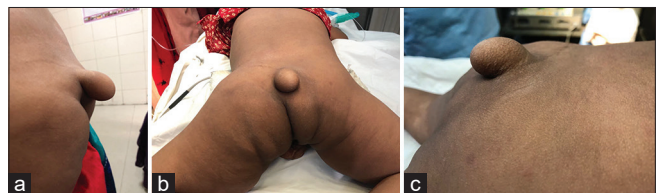
Figure 3: (a-c) Single pedunculated soft-tissue (caudal appendages) mass located at midline in the lumbosacral region (case 3)