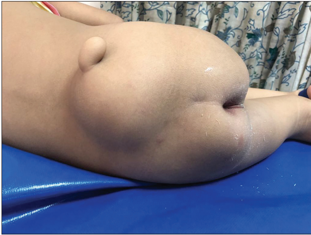
Figure 4: Image shows finger like protruding from the surface of an underlying diffuse soft swelling (case 4)