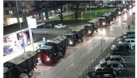
Coronaviruses loaded in army trucks since cemeteries are full (Bergamo 19/03/2020).

Address reprint requests to Marco Scarci, Thoracic Surgery, ASST Monza, Via Pergolesi 33, 20900, Monza, MB, Italy. E-mail: m.scarci@asst-monza.it