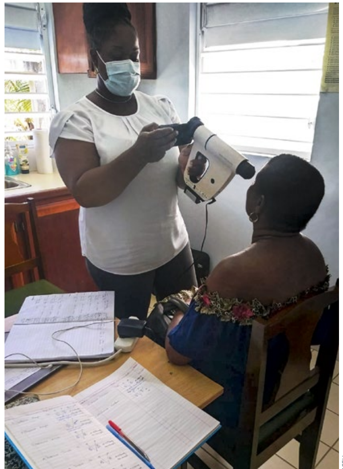
The author examines a patient during a mobile DR fundus photography screening clinic in the north of Dominica. DOMINICA

The mobile screening clinics run from Monday to Thursday every week, and the screeners/graders prepare the schedule of visits to the health centres.